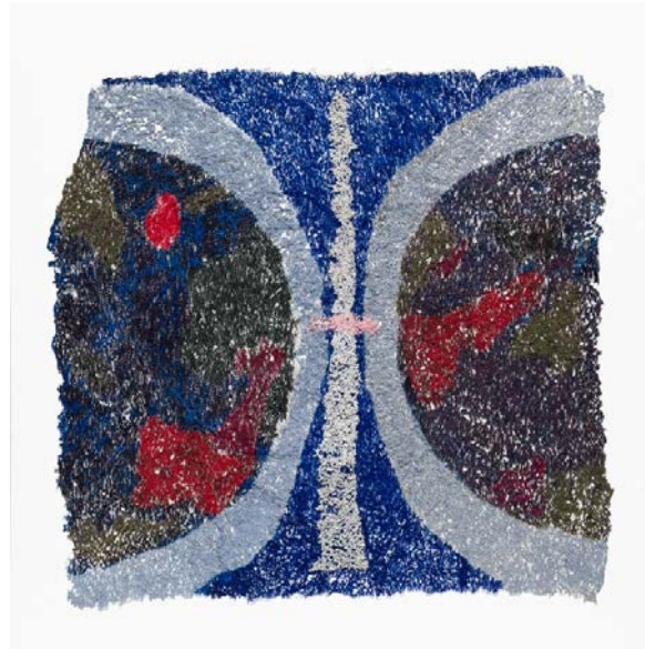
Neha Vedpathak, "Inseparable," Hand-plucked Japanese paper, Acrylic, Thread, 38 x 36 inches.

Neha Vedpathak's work is in multiple private and public collections including the Detroit Institute of Arts, Detroit, MI; Madhya Pradesh State Art Museum, Bhopal, India; Anderson Ranch Arts Center, Snowmass Village, CO; and Camac Art Centre, Marnay Sur Seine, France. Widely shown in the United State, Europe, India, and Singapore, she has been featured in multiple museums and institutions. Her solo exhibition, Time (Constant, Suspended, Collapsed) , opened at the Flint Institute of Arts, Flint, MI in 2021. Additional exhibitions include the Baker Museum, Naples, FL; Arizona State University Art Museum, Tempe, AZ; the Weatherspoon Museum, Greensboro, NC; the Poetry Foundation, Chicago, IL; the National Indo-American Museum, Chicago, IL; and the Jule Collins Smith Museum of Fine Arts, Auburn, AL.