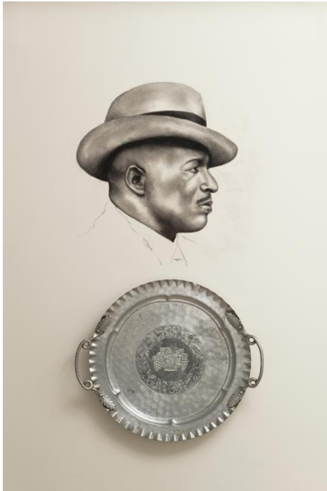
Whitfield Lovell, Spell No. 16

DRAWING, a line goes for a walk February 3 – March 16, 2024